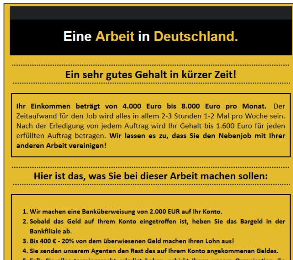
Figure 2: A single spam campaign targeting German users caused problems for almost all products in the test.

What makes these emails difficult to filter is that they were sent from Outlook.com accounts that were likely generated for the purpose (rather than taken over from actual users).